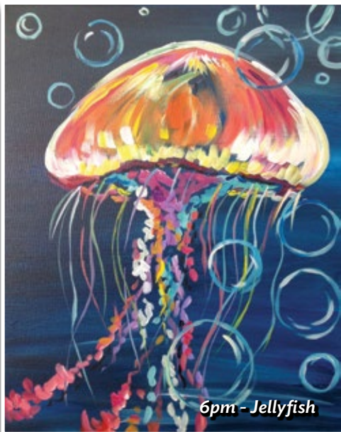
6pm - Jellyfish